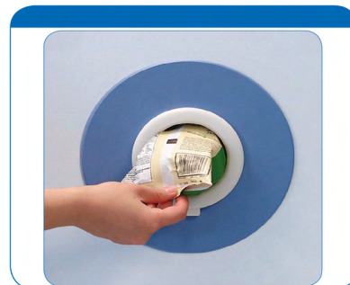
TD-NMR can inspect even through the packaging material of diverse samples, like for quick fat content determination.