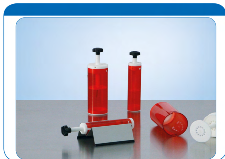
Red Restrainers: while the operator can always watch the animal, the rodent will assume being in a dark place.