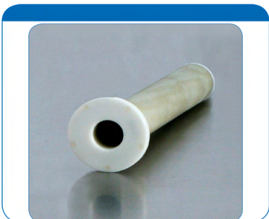
minispec Probe-in-Probe: Unique design to enable measurements on low-weight samples.