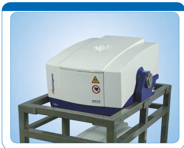
minispec Magnet on Cart for vertical and horizontal Access